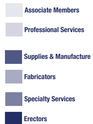
SEAA Member Categories. SEAA maintains a 90% Member Retention Rate