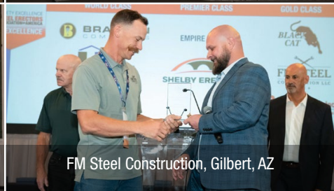
FM Steel Construction, Gilbert, AZ