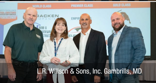
L.R. Willson & Sons, Inc. Gambrills, MD