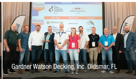
Gardner Watson Decking, Inc. Oldsmar, FL