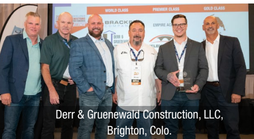
Derr & Gruenewald Construction, LLC, Brighton, Colo.