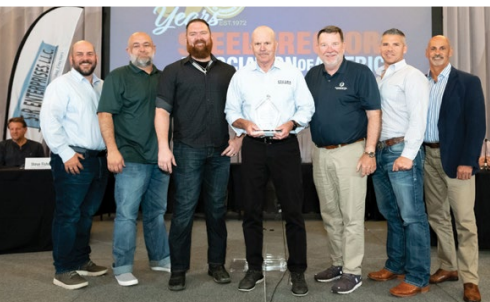
Deem Structural Services, Structural Steel 2022 Class IV