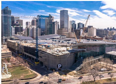
Structural Steel 2023 POY Class IV Derr & Gruenewald Construction Colorado Convention Center Expansion, Denver, Colorado