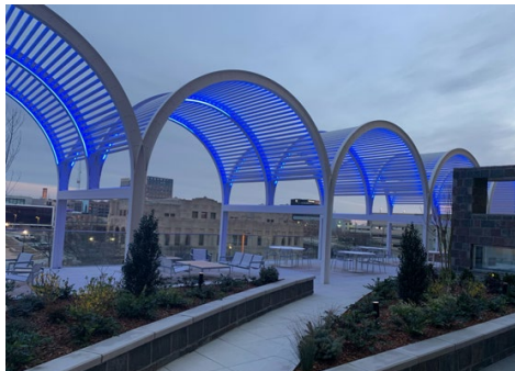
Miscellaneous Metals 2023 Class I Basdent Steel Corp. Tulsa Downtown Pergola, Tulsa, Oklahoma