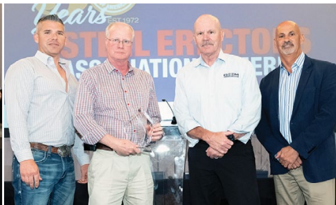
William Steel Erection Co., Inc., 2022 Class III