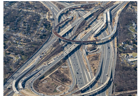
Structural Steel 2023 POY Class III Williams Steel Erection Co., Inc. Transform 66, Fairfax & Prince William Counties, Virginia