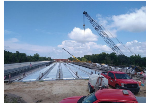
Miscellaneous Metals 2022 POY Class II Shelby Erectors Wekiva 6, Sorrento, Florida