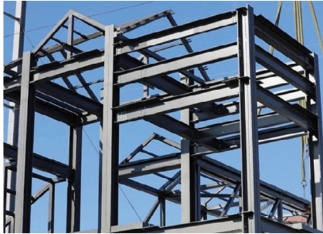
Structural Steel 2022 POY Class I Steel Fab Enterprises Amtrak Middletown, Middletown, Pennsylvania