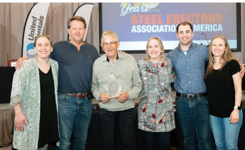
Steel Fab Enterprises, Structural Steel 2022 Class I

seaa.net/project-of-the-year Awards@SEAA.net