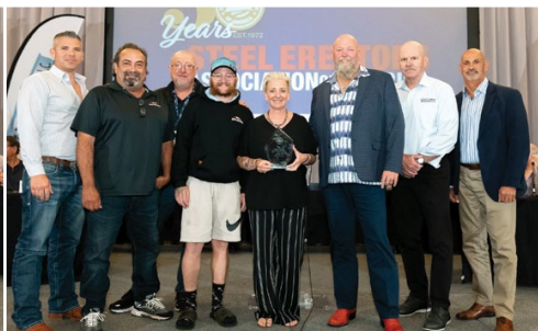
Shelby Erectors, Inc., Miscellaneous Metals 2022 Class II